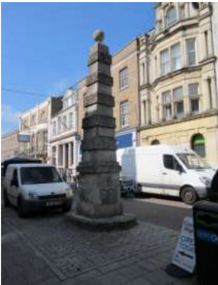
Fig 1. Parking around Town Pump