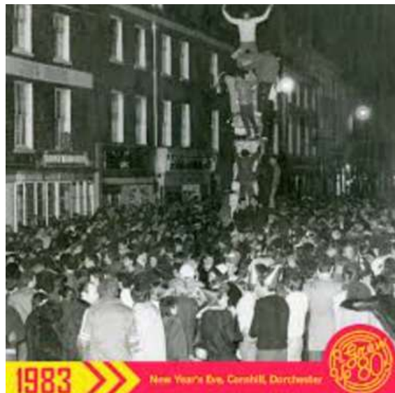
Fig 2. New Year's Celebrations at Town Pump in 1983