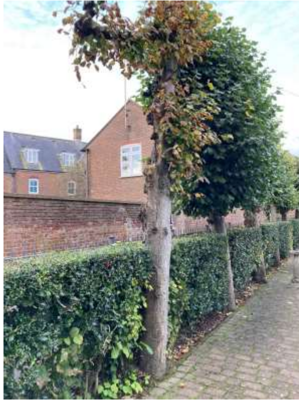
Existing trees showing decay, die back and poor growth.