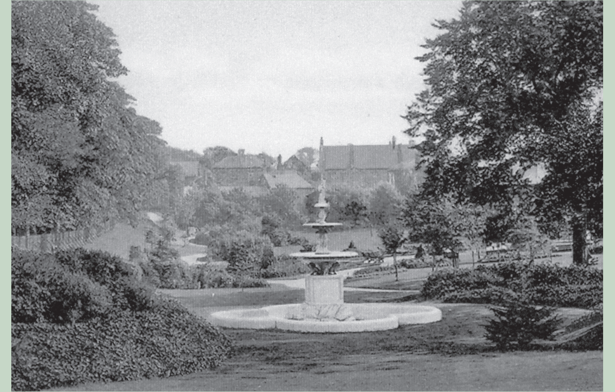
Postcard from 1905 showing a view of the fountain in the 'Dell'