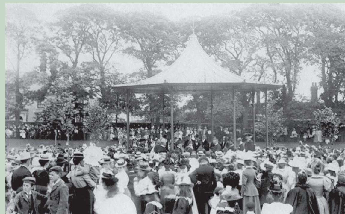
Grand opening of the new bandstand, 1898