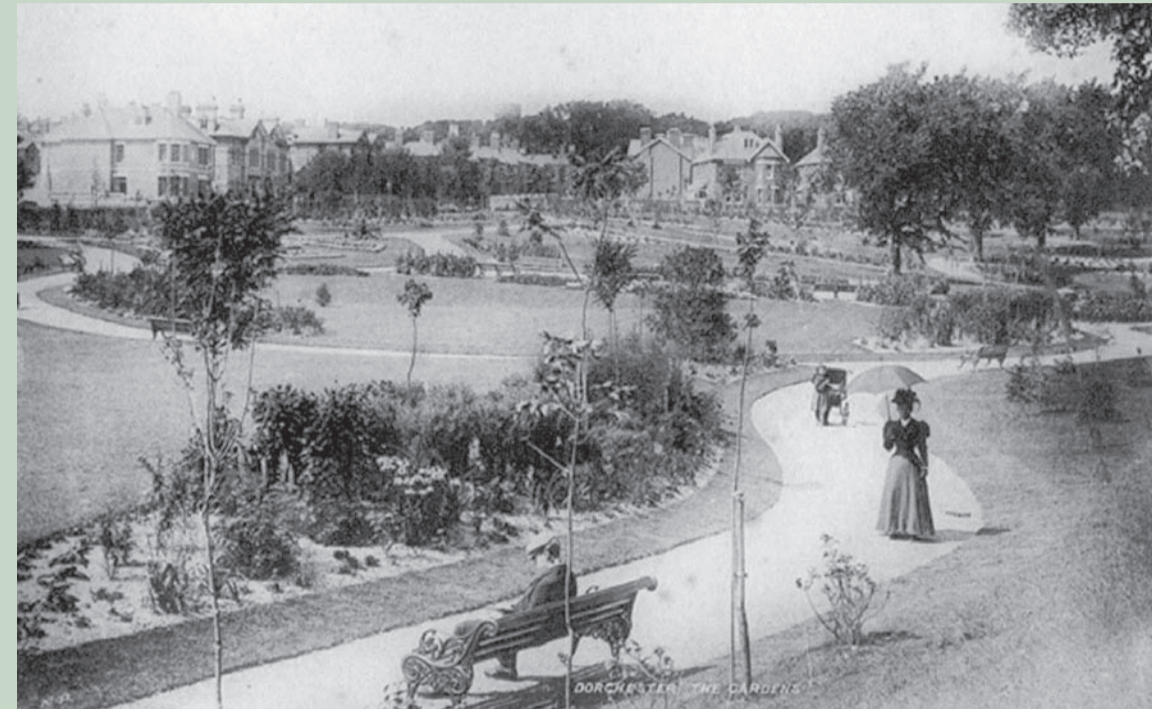
View north west of the shrubberies towards Cornwall Road, from the south entrance on West Walks circa 1895

As well as restoring the gardens to their original character the playground was completely redesigned to provide modern and imaginative areas which are more sympathetic to the historic surroundings.