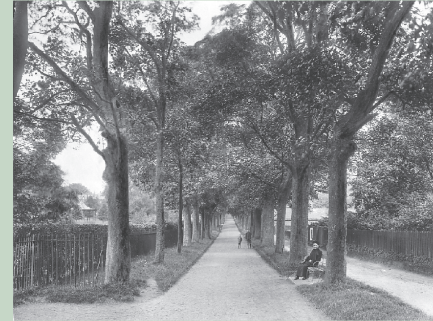
West Walks circa 1922 (Dorset County Museum Collection)