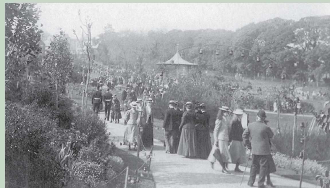
Celebration of the Relief of Mafeking with the gardens lit by candle lanterns Summer 1900