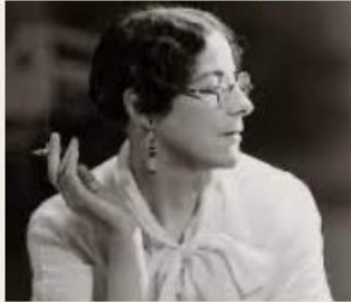
Sylvia Townsend Warner was an English novelist, poet, and an LGBTQ+ pioneer.