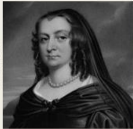
Lady Mary Bankes 1661, a Royalist who defended Corfe Castle from a three-year siege during the English Civil War