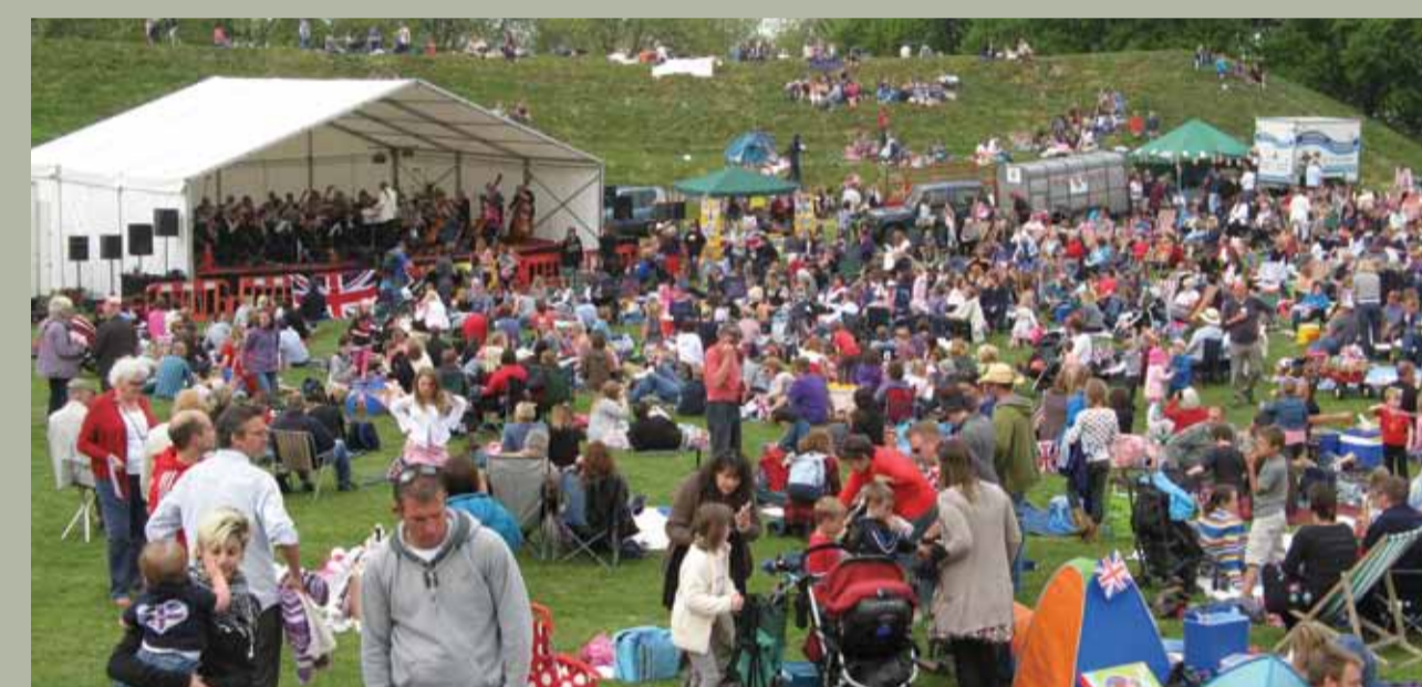
Town celebrations for the marriage of Prince William to Kate Middleton, April 2011. Maumbury Rings continues to be used for events today – including theatre, circuses, festivals and sports.