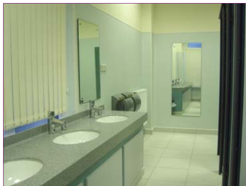
... and, predictably, the ladies!

But that is not the end of the story. Work started immediately after the New Year break to install a platform lift in the Buildings so that wheelchair users and