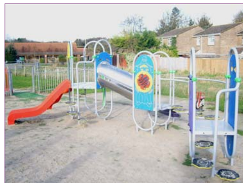
The new play structure for younger children at Maiden Castle Road

provide similar equipment in other parts of the town and, as a first step, we shall be installing the same sort of facility in the Borough Gardens later in the year. It will be on the lawn east of the kiosk, near to both the Albert Road gate and the children's play area, so grown ups will be able to get their exercise there as well as children.