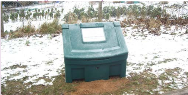
One of the new grit bins at Poundbury Crescent

There are a small number of requests still outstanding but we only have a small budget for grit bins so we cannot deal with those yet. Hopefully, though, the sixteen bins that we have now provided will deal with the worst of the problem.