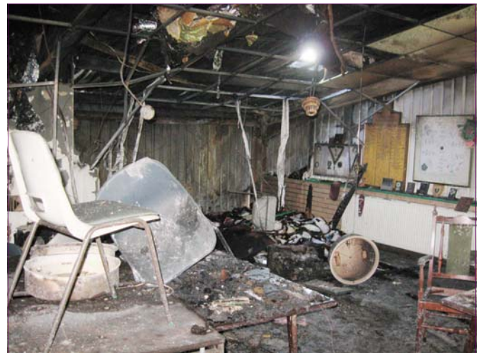
The wrecked interior of the Dorset Room, the headquarters of the Dorset County Bowling Association

We wish the Bowling Club the very best in repairing the damage and getting back to their usual winning ways - we shall do everything we can to help.