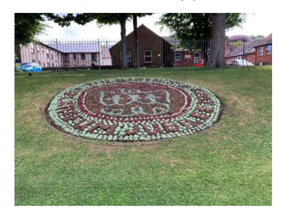
Platinum Jubilee Carpet Bed