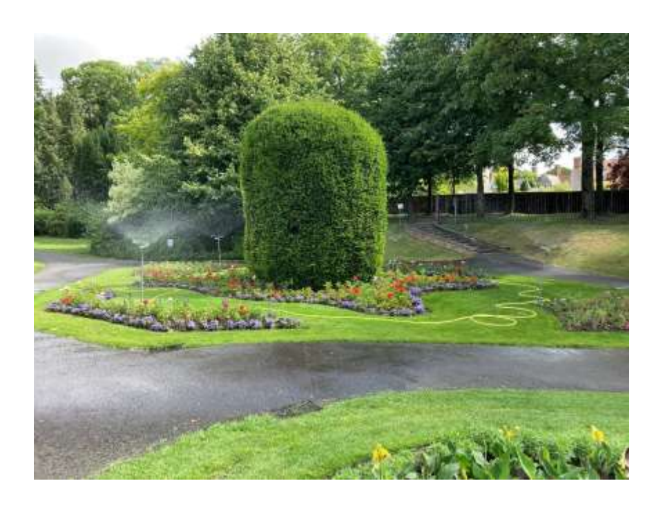
Completed Yew Bed in Borough gardens