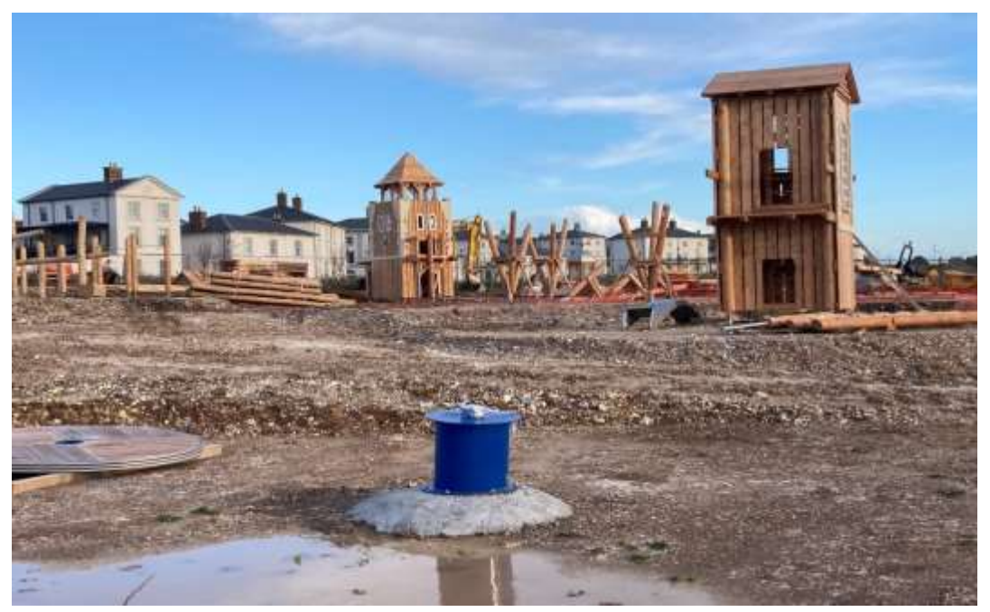
Wide view showing bridge supports between towers under construction.