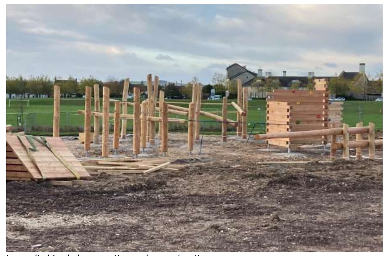
Large climbing balance section under construction