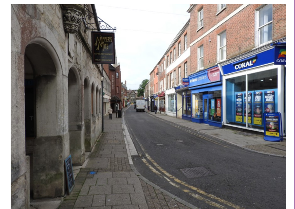
Lower South Street will be paved from New Street, past Nappers Mite to the War Memorial.

Other current projects within the DTEP programme include upgraded traffic signals and changes to the junction at Great Western Cross, funded by Dorset County Council and scheduled for January 2017.