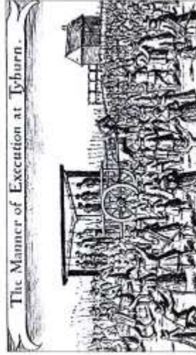
Illustration of a typical public hanging in the 16th and 17th centuries

This is Gallows Hill, Dorchester's execution site in the 16th and 17th centuries, until it was moved to Maumbury Rings around 1703. Condemned people were brought here from the prison below Iken Way (then known as Gaol Lane).