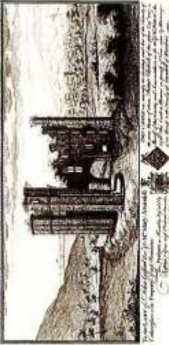
THE MOUNT EAST VIEW OF BOWNE'S CASTLE, IN THE VICINITY OF BOWNE.

The sculptures were erected in 1986. Two of the three bronze figures – unidentified prisoners – resolutely confront the third, who, cowed and gowned, seems to represent the Hangman or Death.