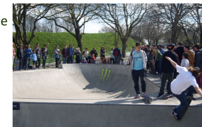
In 2016 the Skatepark, home of annual Skatejam events will be refurbished

Questionnaire - we welcome your feedback on this summary of our draft Corporate Plan, and will consider your comments before formally adopting a final Plan in May.