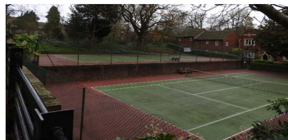
Trinity St Tennis Courts, unused in winter due to trees