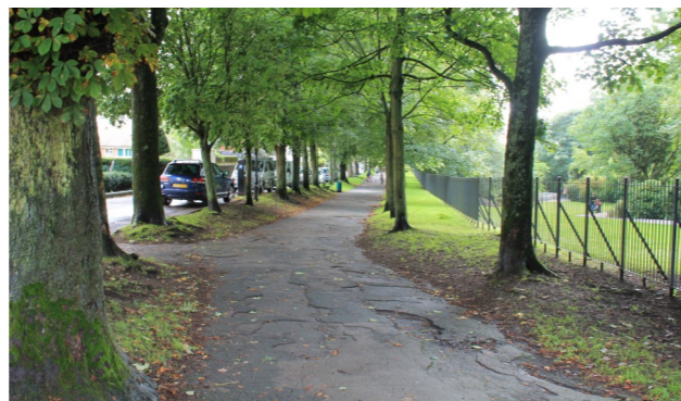
Working with DCC we will refurbish The Walks, which follow the lines of the Roman town

pieces of heritage around the town, and install a new pedestrian visitor signage scheme in the town centre.