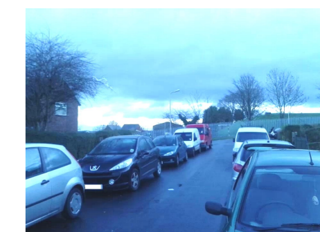
Many residential roads suffer from double parking during the working week.