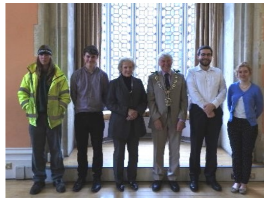
Apprenticeships in the town have been jointly funded with WDDC