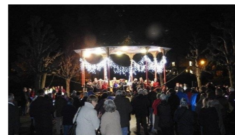
Supporting the "Friends of the Borough Gardens" Carols event in 2015