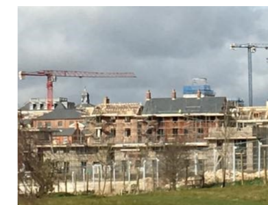
Cranes on Poundbury, likely to be finished in around 10 years time