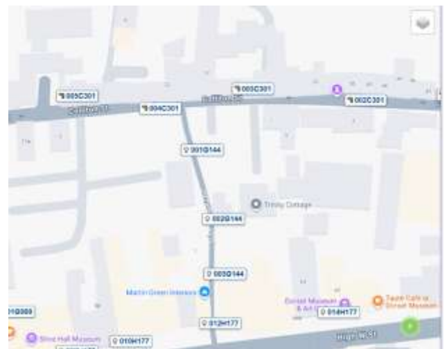
Figure 2 Steet Light Locations in Grey School Passage

The Committee is therefore asked to consider whether it wishes to support the application and, if so, whether it would like the application to be made by Dorchester Town Council.